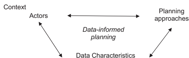
Figure 1. Framework for evidence-informed urban health planning.

plans developed by the city governments at the lowest administrative level (Dhaka City Corporation, Long Bien district health bureau in Hanoi and Pokhara municipality). This is because mainstream government systems provide regular and stable information source and annual plans typically operationalize multiple policies and strategies and guide the actual implementation of activities. Two caveats are appropriate. First, we recognize that other forms of evidence can inform planning decisions, e.g. research (Rychetnik et al. , 2002; 2004; Nutley et al. , 2012; Mirzoev et al. , 2013; Witter et al. , 2019). Second, we acknowledge that data (and other forms of evidence) can inform multiple urban policies and plans across the national and local levels. Our primary focus remains on the use of data from mainstream information systems within annual urban plans. However, to help understand the context of urban health planning, in reporting results, we also highlight the range of urban health plans, identify planning actors and explore key influences on data-informed planning across the local and national levels.